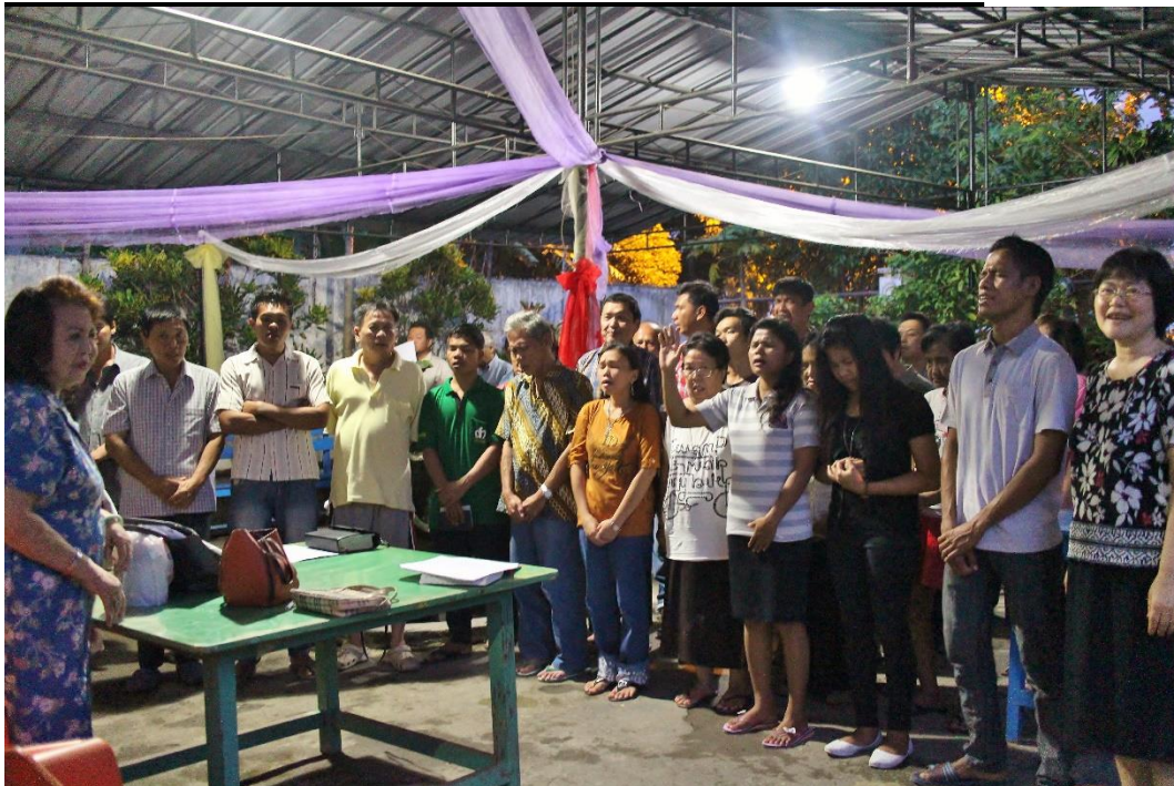
Photos of singing hymns at the Dulos mental Hospital.